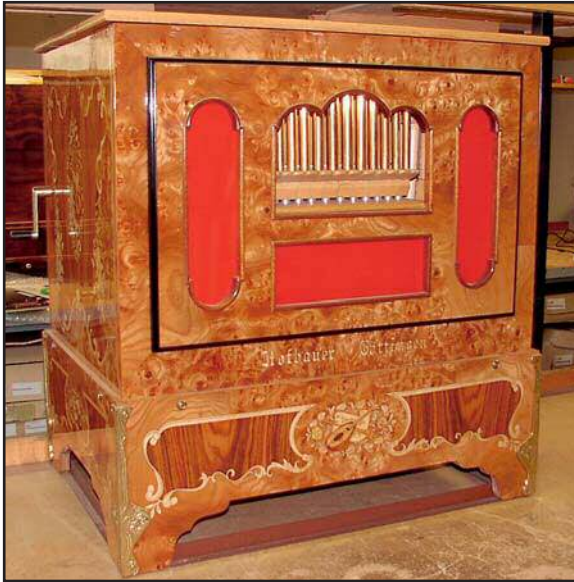
Figure 6. A beautiful 33-note Hofbauer organ made in the style of Bacigalupo.

He then realized that there was a new and growing demand for crank organs and started the production of do-it-yourself crank organs—I bought one myself at that time (Figures 2 & 3). Also his company produced flute clocks (Figure 4). Soon was the production of the roll-operated crank organs (from 20 keys to 45 keys) and later, microchip-operated organs became the center production of the company while church organs were still produced (Figure 5).