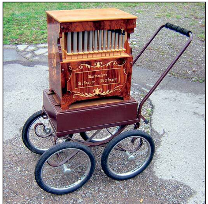
Figure 5. A 20-note Harmonipan hand organ in the collection of the late Harvey and Marion Roehl.