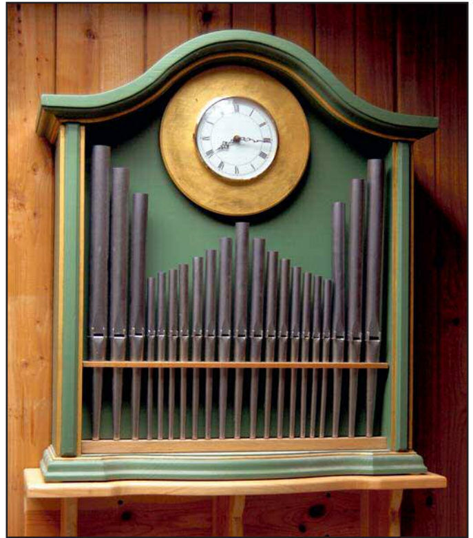
Figure 4. A 20-note flute clock built by the Hofbauer organ company. The organ portion operates from an especially designed 15-tune computer cartridge.