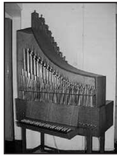
Figure 1. An early Hofbauer pipe organ made for the home.