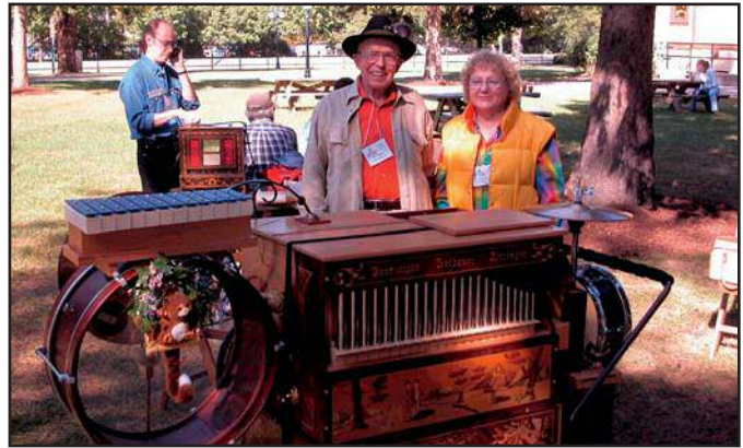
Figure 7. A 38-note (with 76 pipes, percussion and additional glockenspiel) Harmonipan organ in the Trager Collection.

tion was in the evening news on German television. It sure promoted sales, especially those of the Hofbauer company.